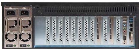
Model GO 44