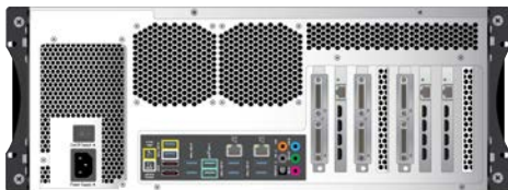
Model GO 28 / 28-RP